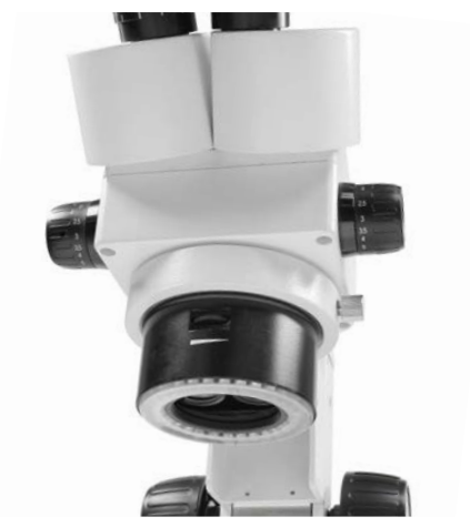
Dimmable, integrated LED ring illumination